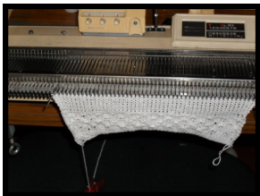
One of the first dishcloths on the Empisal Knitting Machine