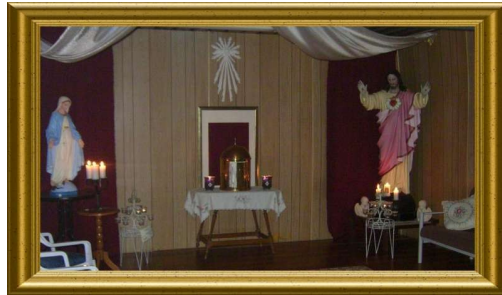
The Upper Room