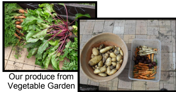
Our produce from Vegetable Garden