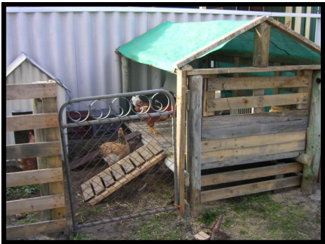
Our beautiful chook pen