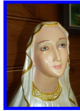
Through Mary to Jesus