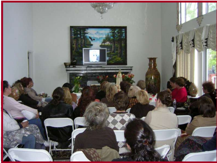
The group at Azhar's house in Burbank, Los Angeles.