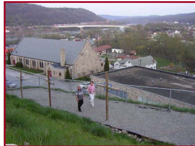
Taken from the prayer garden at the Rotundini