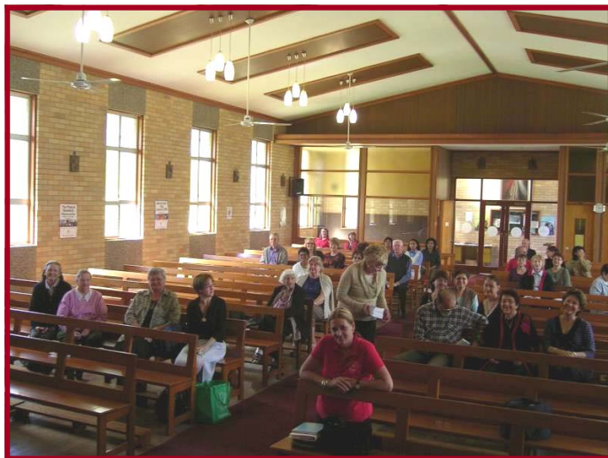
The start of the journey at St. Christopher's in Holsworthy.