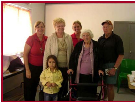
Group from St. Christopher's Sydney