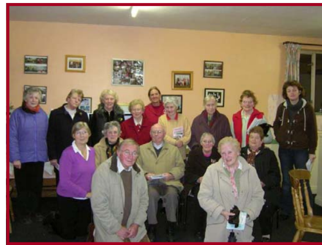
Group in Tipperary