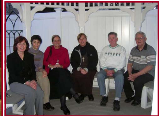
Picture taken in the Rotunda in the prayer garden