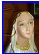
Through Mary to Jesus