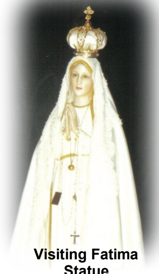
Visiting Fatima Statue